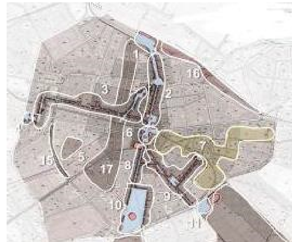
Fig. 4. Public spaces defining the identity of the city of Sofia.

Summarized data from a survey carried out among 400 residents of Sofia City in August 2012 as part of the development of the Integrated Plan for Urban Reconstruction and Development of the city of Sofia.