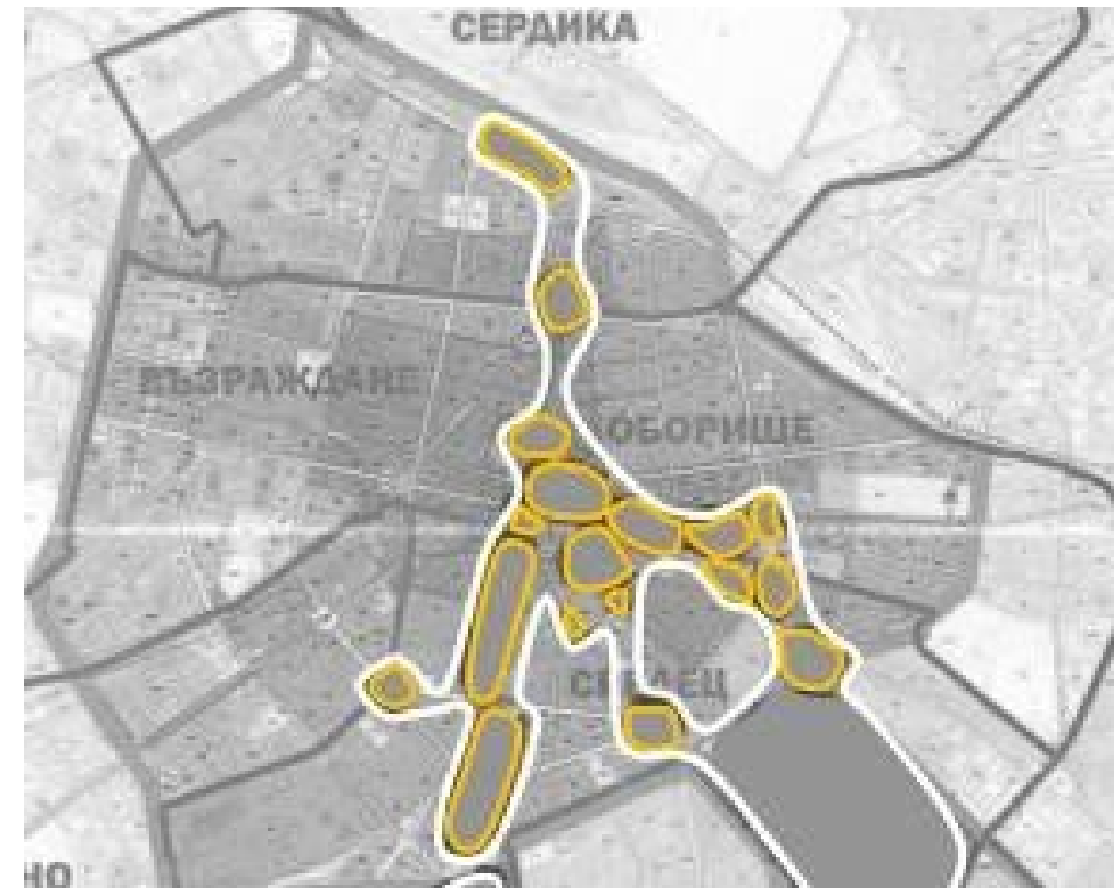
Fig. 3. Emblematic places in the center of Sofia.

To fully disclose the potential, it is essential to have a sustainable policy for its promotion. The results of the same survey show that the majority of the citizens of Sofia are not aware of its cultural heritage and do not adequately assess it. Moreover, for the majority of citizens, cultural heritage is an obstacle to the realization of various investment initiatives, with cultural values not being perceived as an opportunity but as a hindrance. In order to overcome these problems, it is necessary to activate and implement different forms of popularization and pedagogy of the heritage - an activity that covers the different age and target groups.